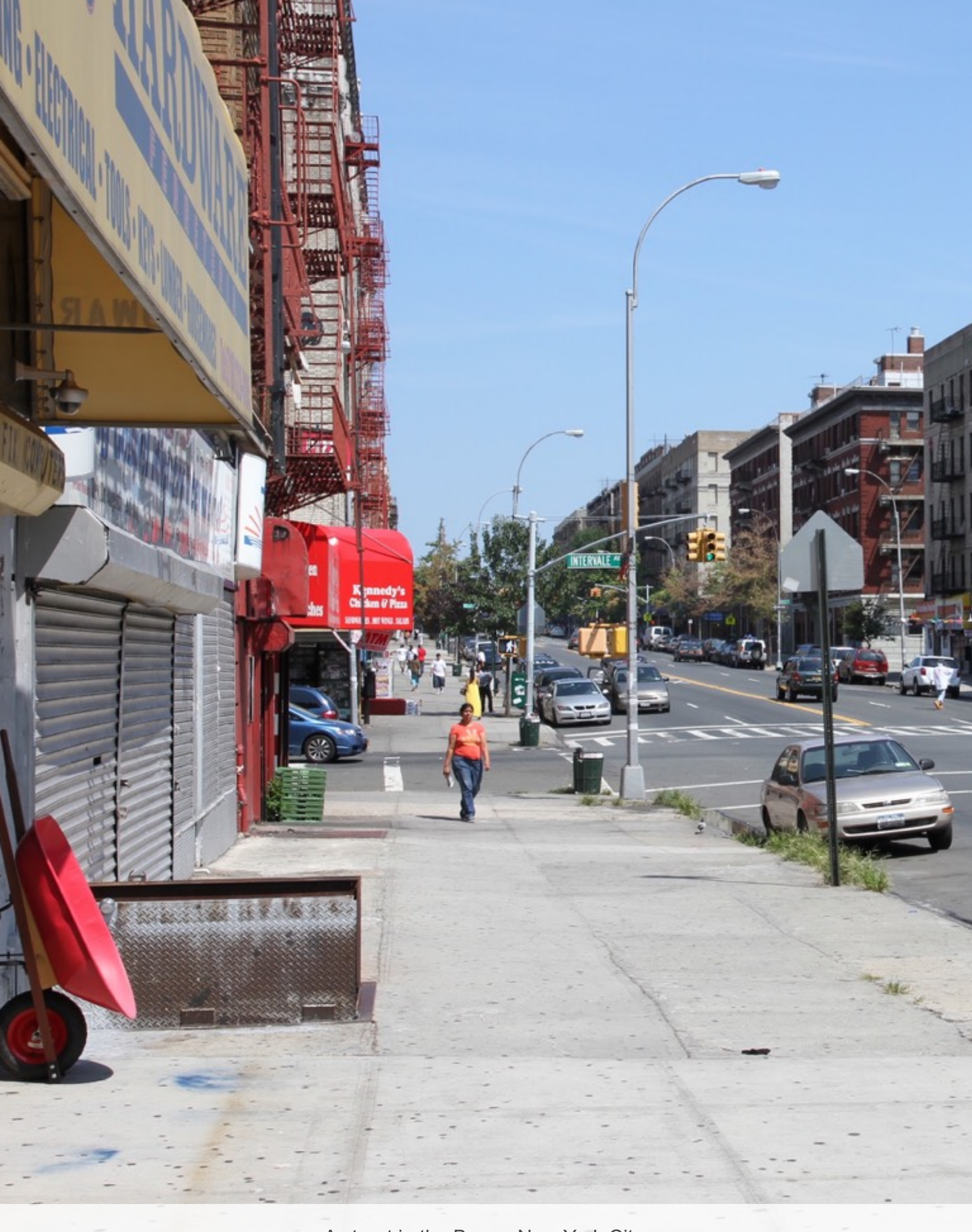
A street in the Bronx, New York City.