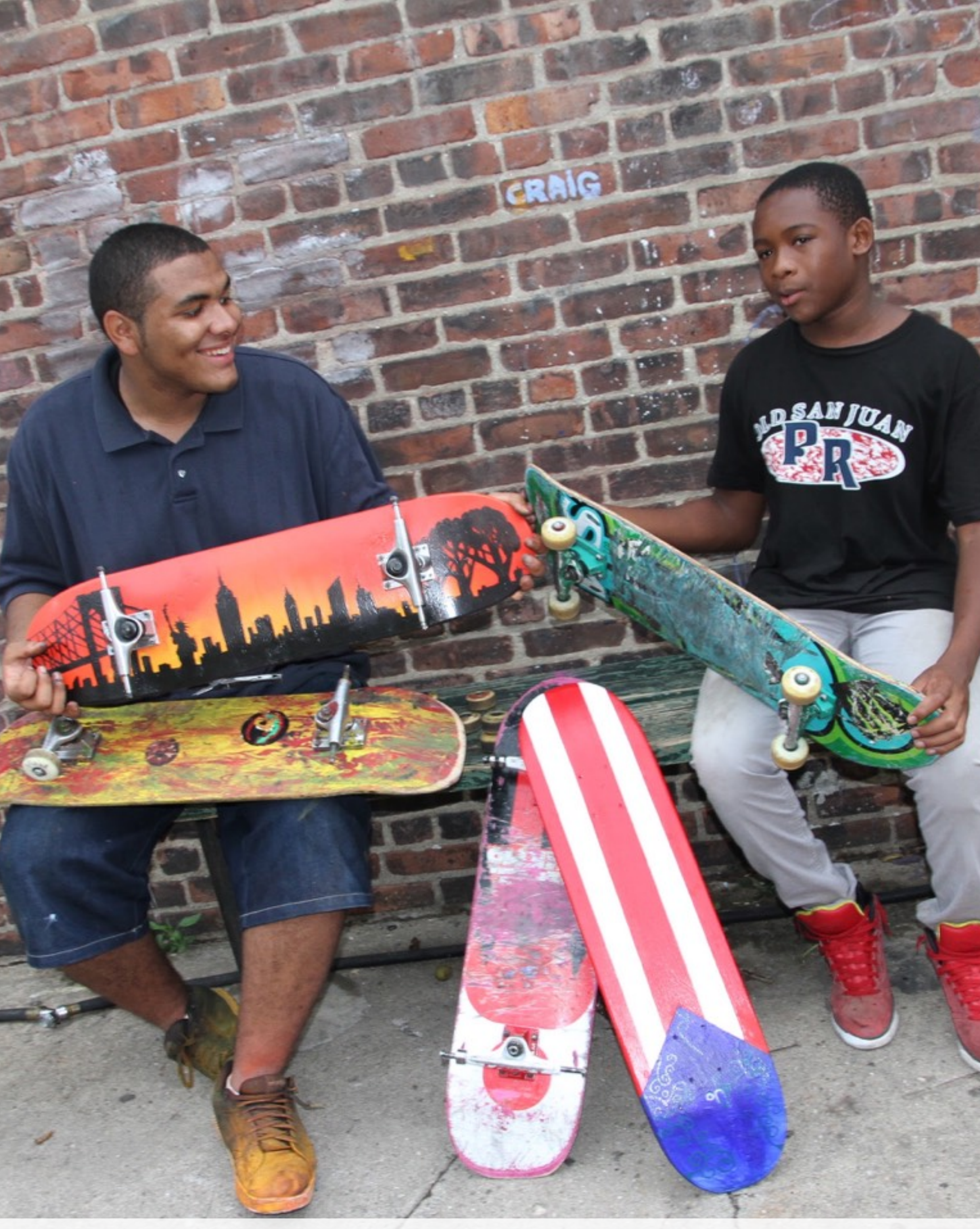
Participants of the "Eco Ryders" urban environmental education, green skateboarders' program. See more: <a href="https://youtu.be/LvPWty306Qo">https://youtu.be/LvPWty306Qo</a>