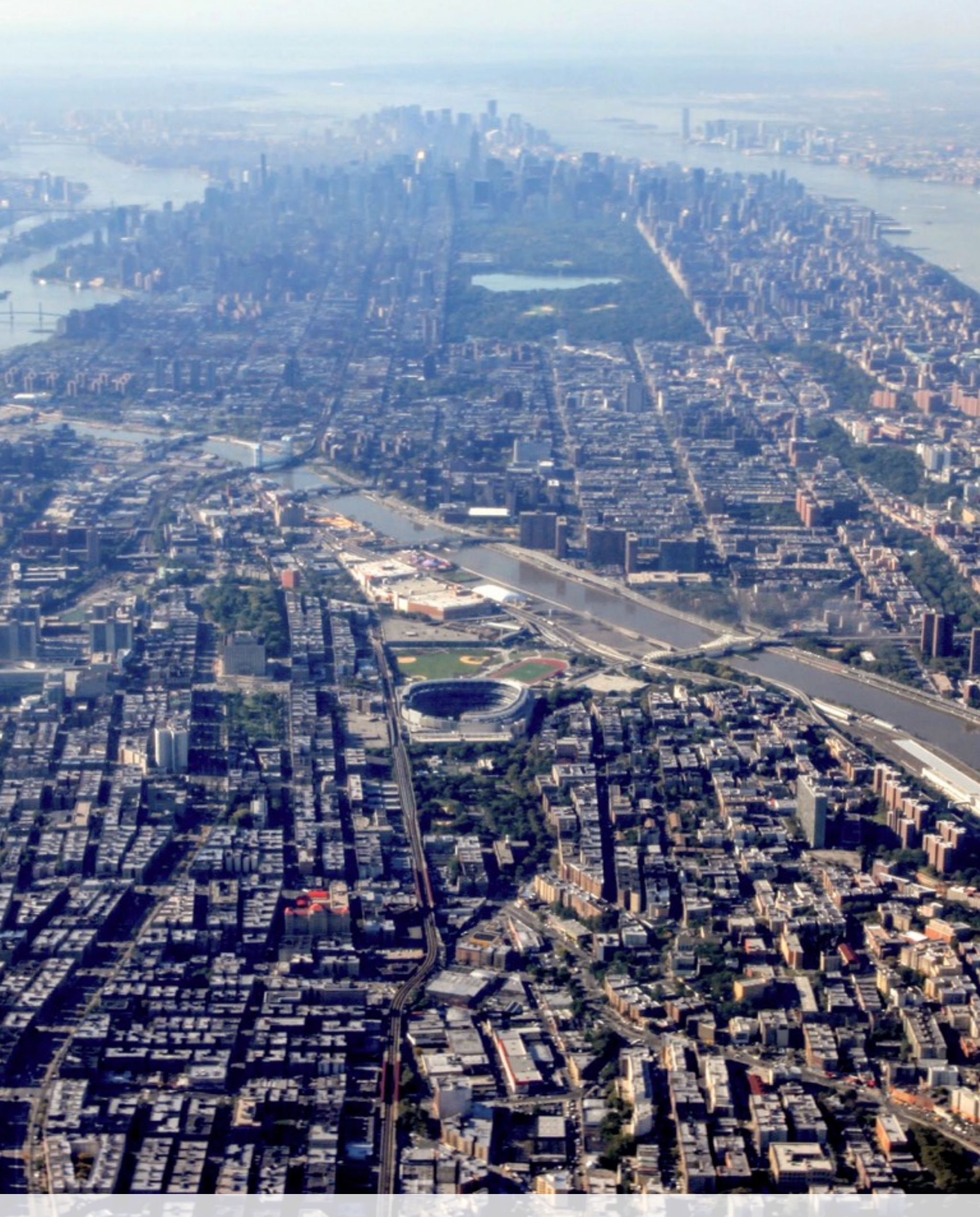
The Bronx, Manhattan, and New York City's waterways.