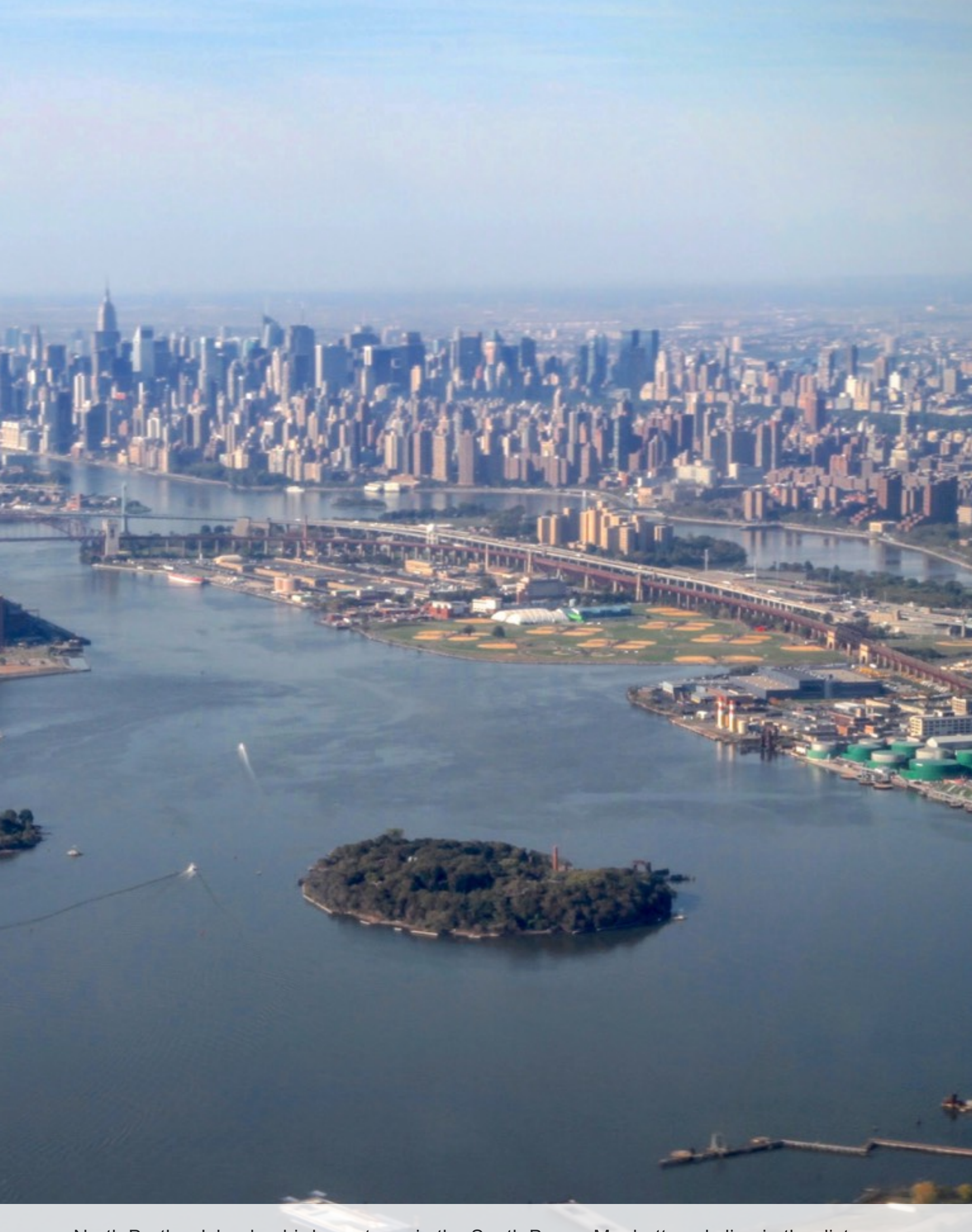
North Brother Island, a bird sanctuary in the South Bronx. Manhattan skyline in the distance.