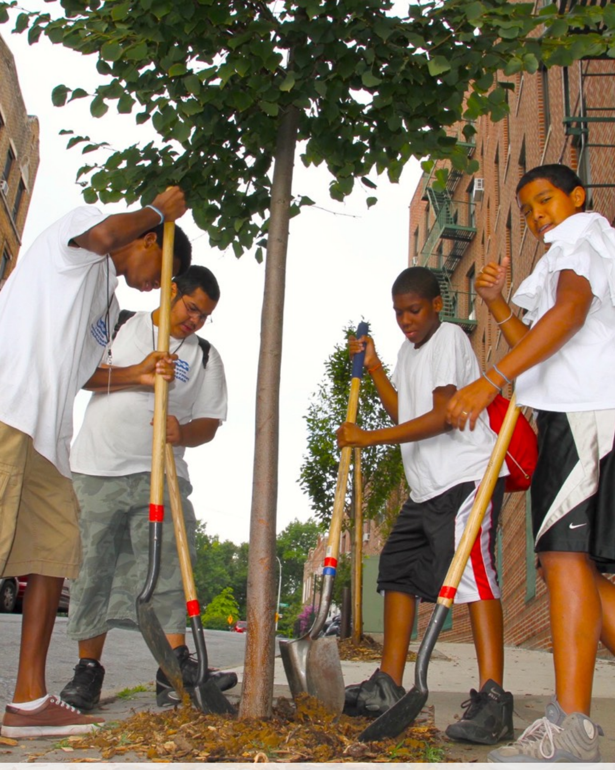
Young volunteers at the Monosholu Development Corporation are taking care of street trees. North Bronx, the Bronx River watershed.