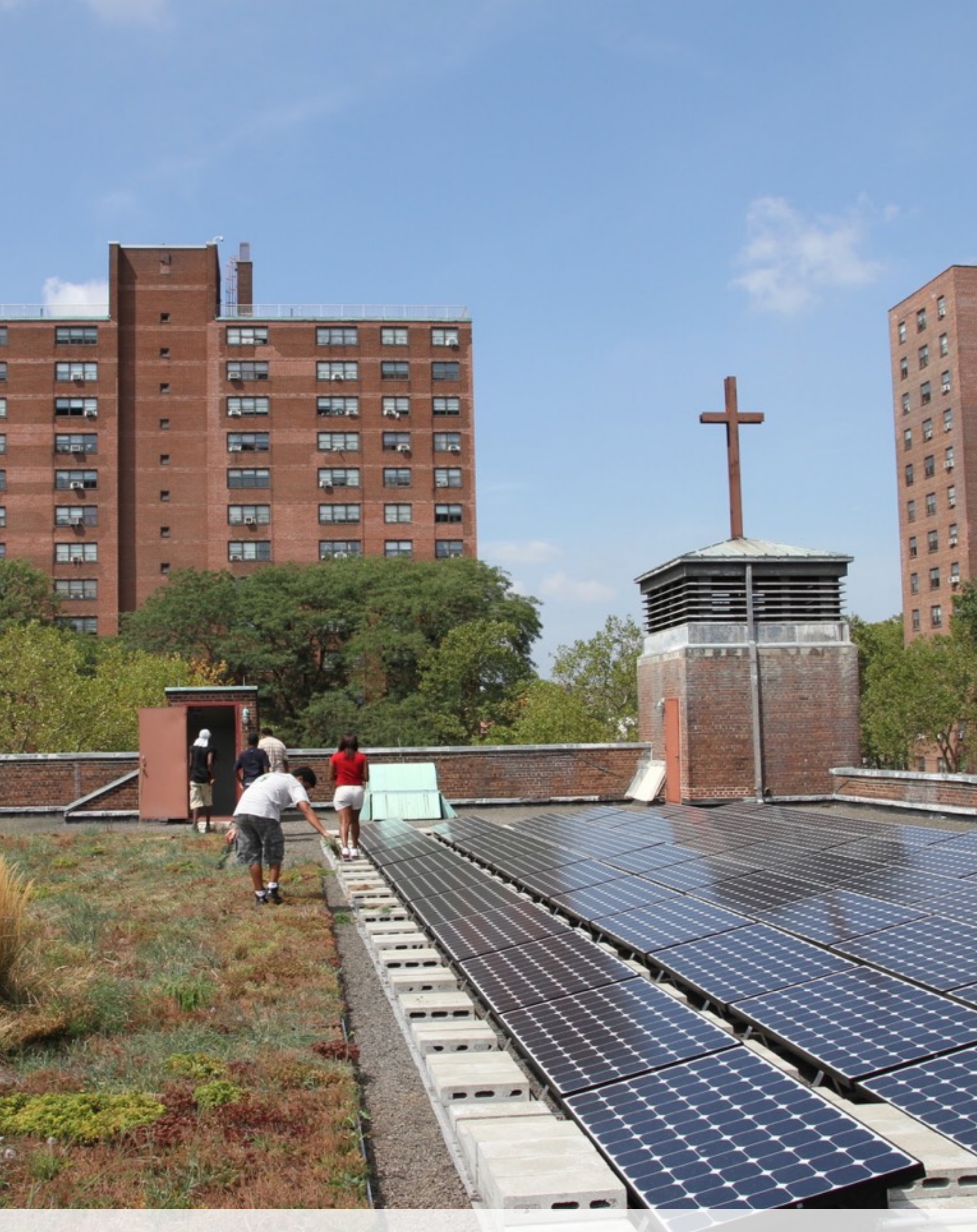
Green roof on top of St. Joan of Arc church in the South Bronx.