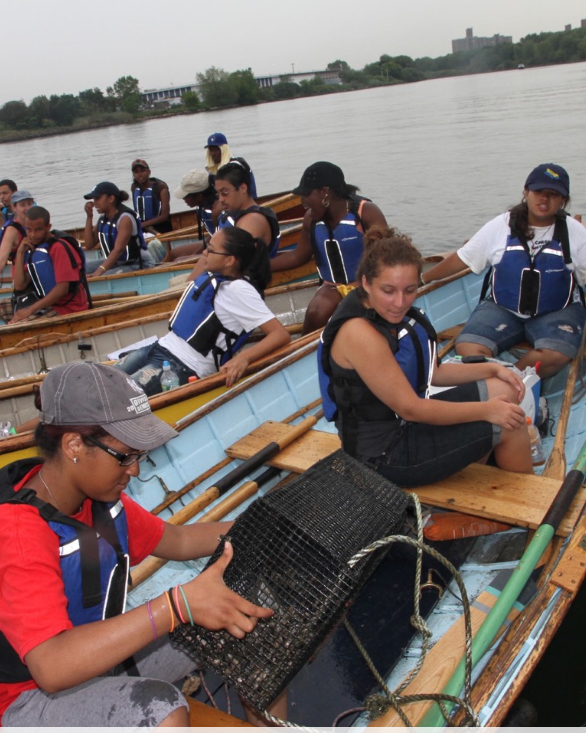
Program assistants from Rocking the Boat, and students from Satellite Academy High School are monitoring an oyster garden in the Bronx River.