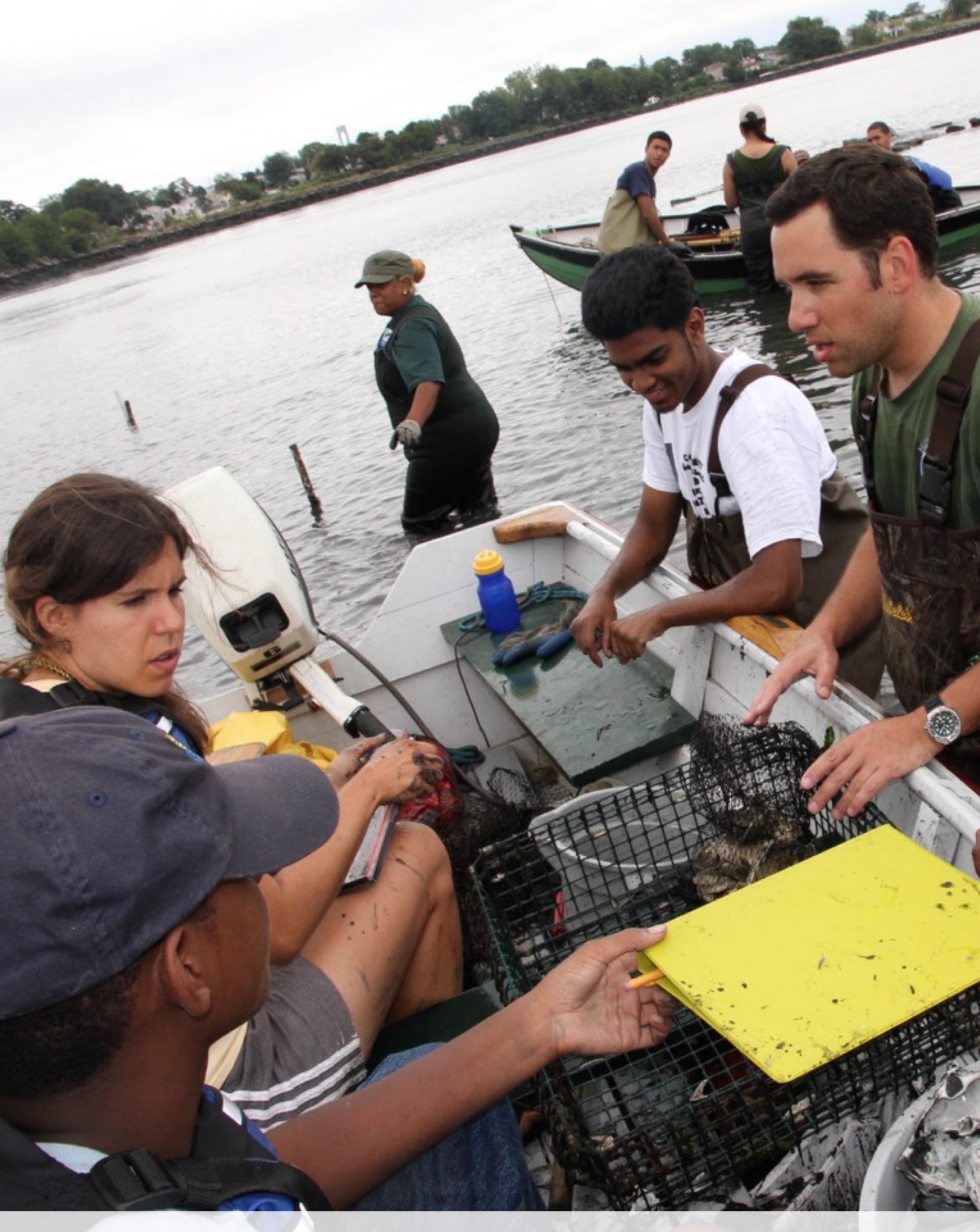
Staff and students from Rocking the Boat and the Bronx River Alliance restore oyster reefs.