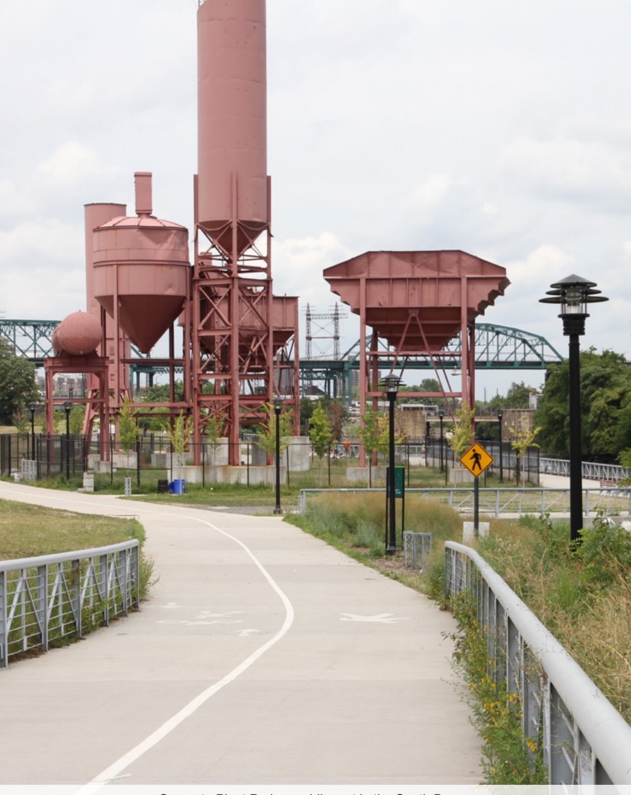
Concrete Plant Park, a public part in the South Bronx, was created by the Parks Department in partnership with community-based organizations.