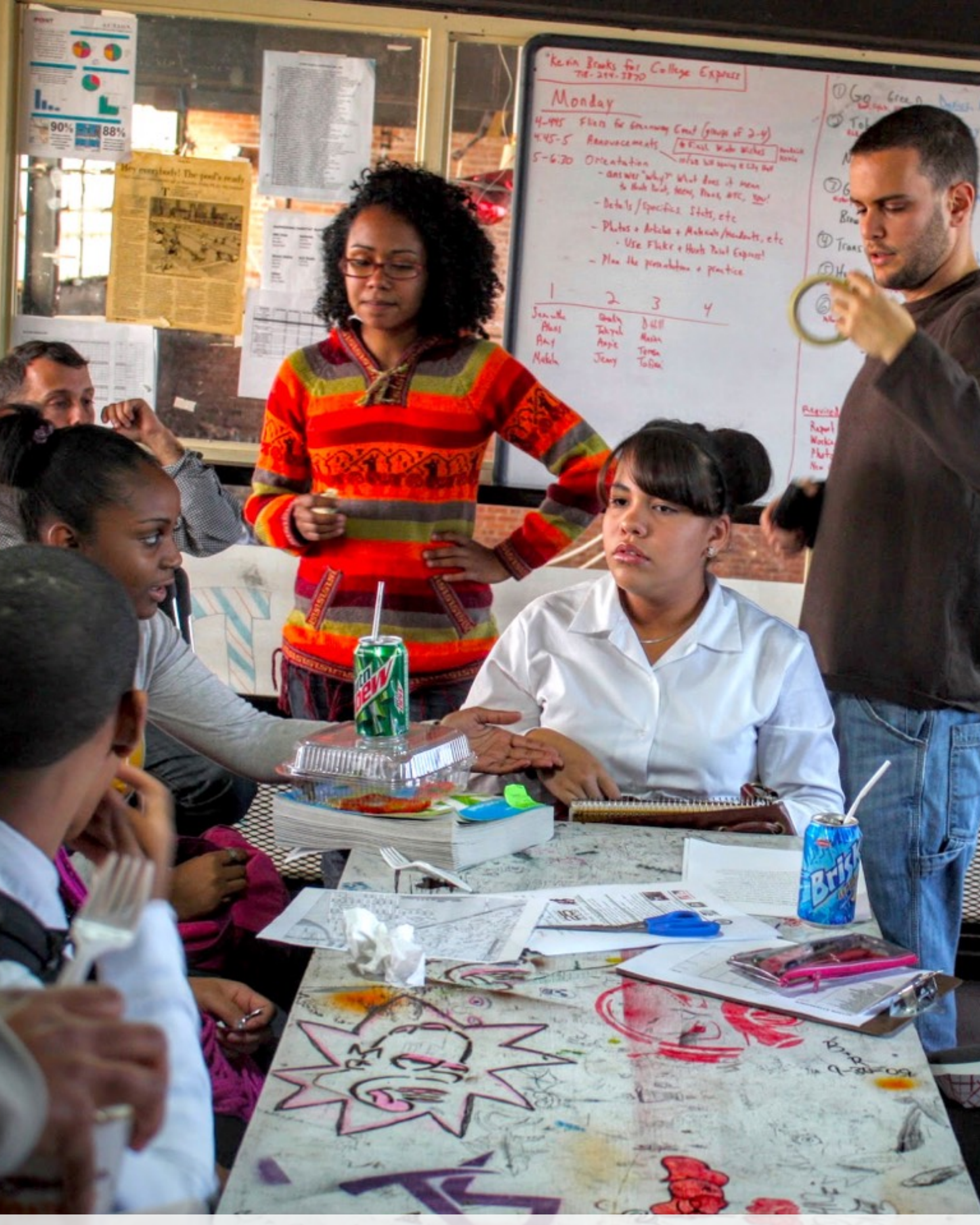
Educators and students at the THE POINT community development corporation, gathering to plan environmental stewardship activities.