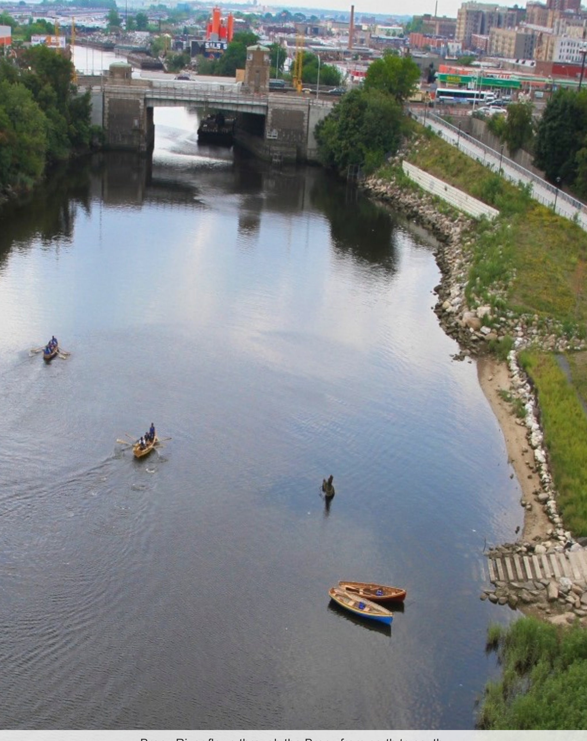
Bronx River flows through the Bronx from north to south, surrounded by open space, residential areas, industrial sites, and transport corridors.