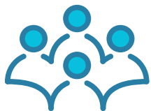
NSTA conferences and workshops