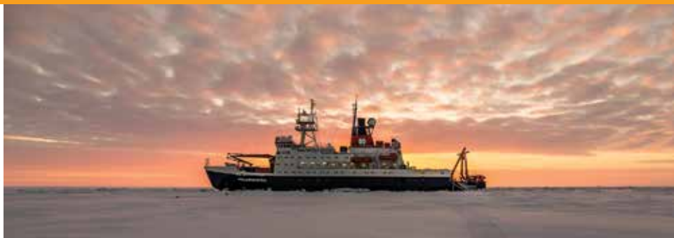
Short Course SC-7: NESTA and CIRES: On Board with MOSAiC: Unprecedented Science and Curriculum from a Year in the Arctic