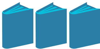
NSTA Press books