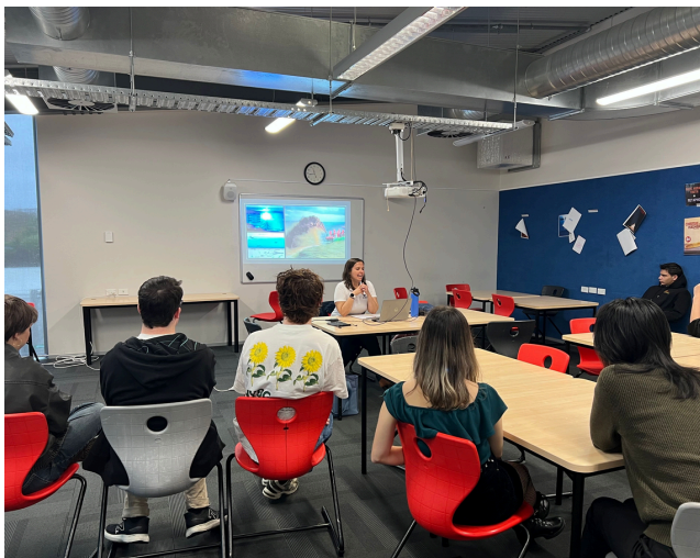
Albany Senior High School International Junior SeaKeepers South Pacific Chapter