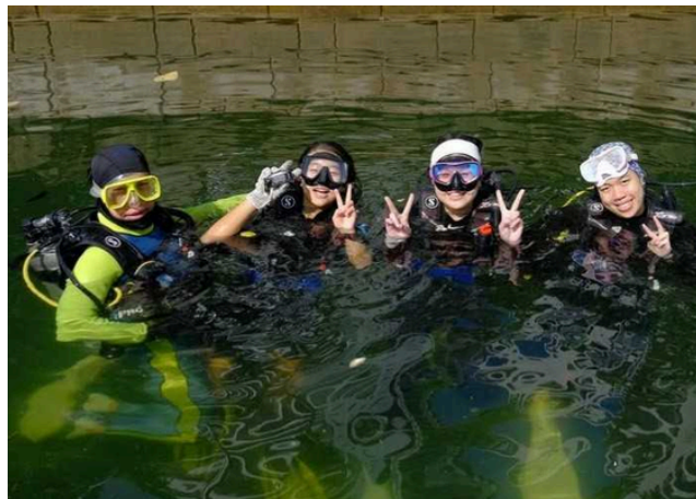
Divers at the Kaia Initiative Asia Chapter

"We are pleased to collaborate with the Kaia Initiative to offer participants the chance to learn new skills and gain direct ocean experiences."