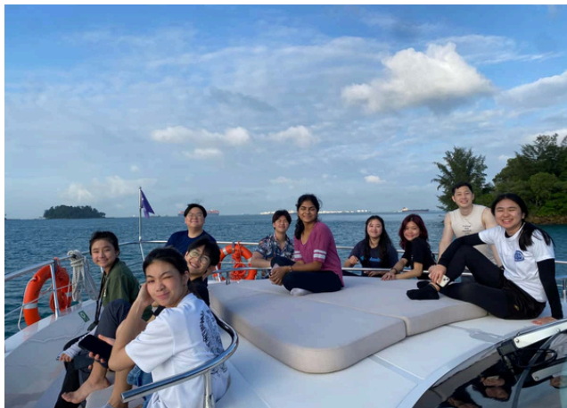
NUS College Learning Field Trip Asia Chapter

In collaboration with Kaia Initiative, two selected applicants from Asia will receive a sponsored opportunity to experience the Kaia Initiative Youth Diver Course, earning their PADI Open Water Certification.