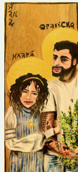
St. Francis & St. Clare of Assisi