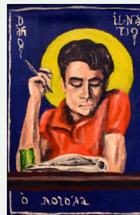
St. Ignatius of Loyola