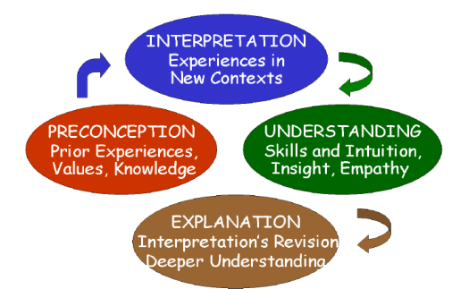
Figure 3: Heuristic-hermeneutics processes in the socio-cultural learning niches.

The process implies many changes, transformations, reconsiderations, revisions, and significant expansions in concepts and ideas; as a process of exploration, inquiry, and discovery – rather than a recording or a re-presentation of an already established and finalized position – it builds the ground to create new paradigms for being-in-the-world.