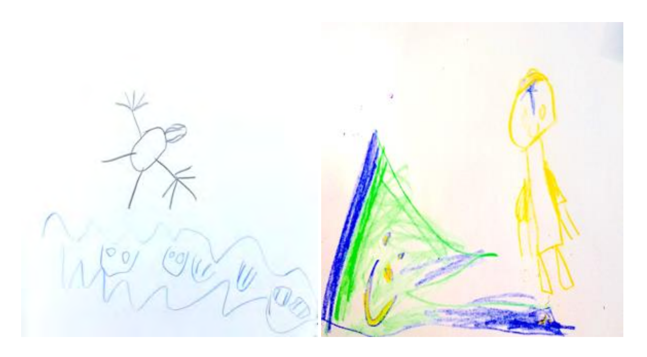
Figure 2: Water Song Drawings

The children and Marleen stand to face the creek. Marleen leads the children in asking the creek for permission to share the song. Their singing is accompanied by rattles that Marleen has brought, which the children take turns shaking. The song they sing is profoundly pedagogical. It teaches continual respect, love, remembrance and responsibility for the waters of Central Texas. It teaches relational ontologies of water that include: the capacities of water for emotional and physical healing; inseparability of water from human bodies; and the many places through which waters come together, including the rains and rivers (Villanueva, 2018). As we discuss further later in the article, this song is also a place story – that (re) maps and situates the waters of this place as Indigenous lands.