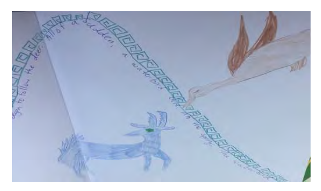
Figure 3: Sharing the Coahuiltecan Creation Story

As misty rain fell one morning, we gathered on the grass mat next to the creek and Marleen told the creation story of the Indigenous Coahuiltecan people of central Texas, using visuals that she drawn (Figure 3).