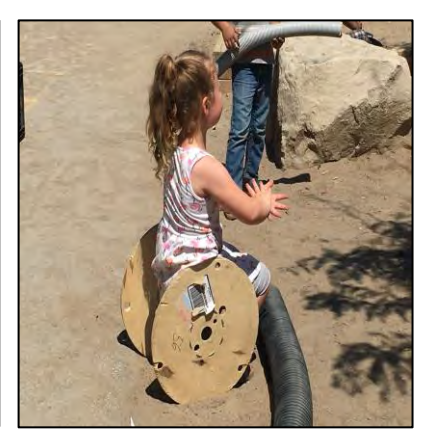
Figures 3, 4 and 5. Child playing with an industrial spool that has been transformed into a 'loose part' to support the movement of her body across the time and space of the school playground.