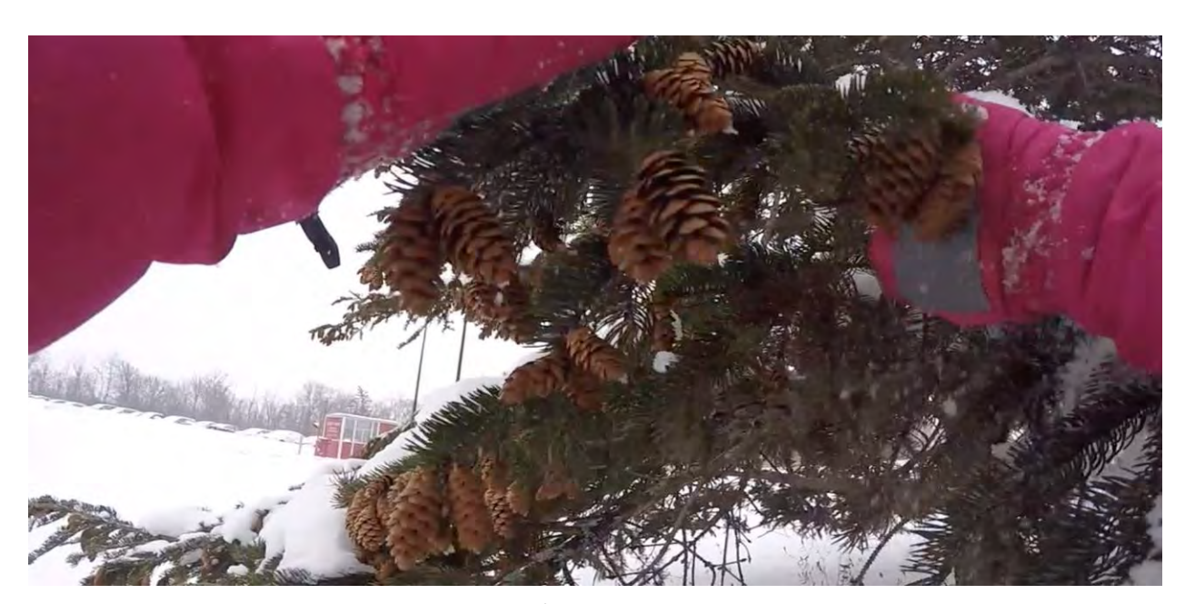
Figure 3: Human/nonhuman Entanglements

Barad (2003) reminds us that "practices of knowing cannot be fully claimed as human practices, not simply because we use non-human elements in our practices but because knowing is a matter of part of the world making itself intelligible to another part" (p. 829). The sights, sounds, bodies, GoPro, materialities all entangle in this moment of dynamic intra-action. Each time we return to the video it affords us an opportunity to hear, see, and feel something else. The GoPro is entwined with the children's bodies and the actions that unfolded were incumbent of bodies and cameras entangled with each other, humans and materials' agentic forces each affecting the other. How does the GoPro help us to understand things in-phenomena (Barad, 2007)?