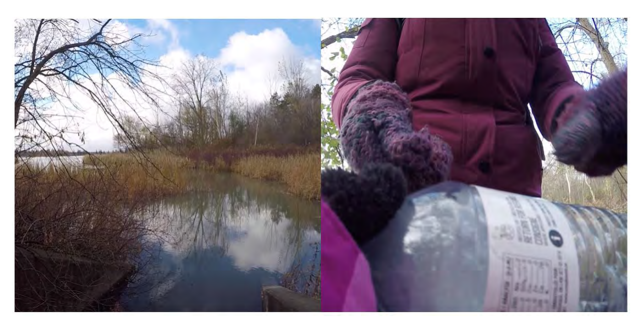
Figure 4: Unsettling Encounters in a Favored Spot

The pristine lake is framed by the orange-reddish glow of an autumn marsh, a blue sky with fluffy white cumulus clouds, all reflected in the stillness of the water (Figure 4). The GoPro and child's body turn to pan the wooded area directly behind where multiple other plastic bottles litter the woods. Etta paused momentarily before forging into the woods to collect a plastic bottle. The leaf covered ground rising up in clear view of the lens, movements are unbalanced, a plastic bottle is grasped, first resisting Etta's efforts to untangle the bottle from its resting place amongst the underbrush. The sound of ice rattling can be heard on the video along with Etta's voice remarking "ice in it, ice in it". There was a crinkle of the plastic refuse bag, and her educator's comment, "oh you missed" as the plastic bottle resists being deposited into the bag and falls to the ground. Etta reaches down to retrieve it and successfully deposits into the bag the second time (Figure 4). A bright yellow plastic drinking cup with vivid purple letters is burrowed underneath a nearby tree, the GoPro and child crouch beneath the prickly branches of the tree that protect the cup and slowly retrieve the litter. A flash of yellow disappears into the refuse bag. (Researcher's Interpretation of GoPro Recording)