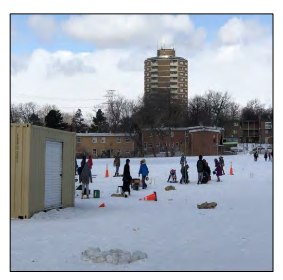
Figures 1 and 2. Children playing with loose parts (i.e., pylons and pool noodles) on the schoolyard. Medium-sized shipping container was purchased to house the loose parts.

Deleuze and Guattari's philosophies offer early childhood educators a creative toolbox of concepts to work/think with (see Jackson & Mazzei, 2012). Their concept of the partial object lends well to theorizing loose parts as material and spatial objects that co-shape the surround and/or learning environment through emergent collectivities of play. Thinking about loose parts as partial objects, Deleuze and Guattari warn that it is not enough to say that the object is a creative tool of expression. The object must be connected to the process of production, and for purposes, here, the process of play and how it works and