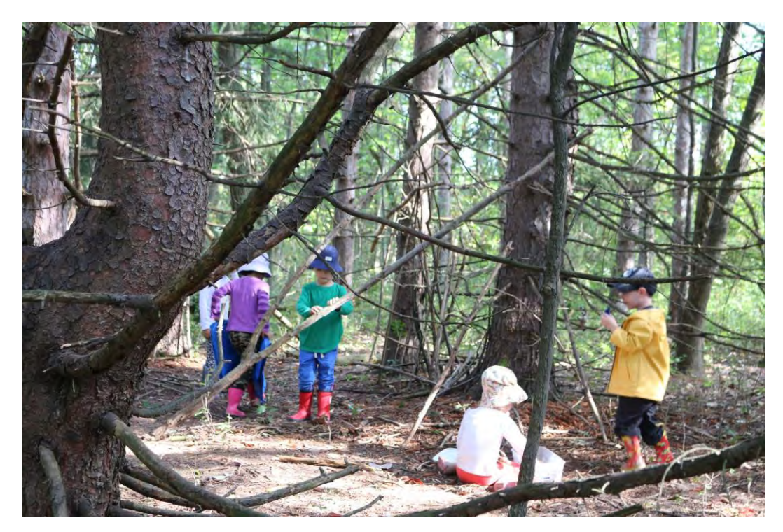
Figure 1: Woodland Context