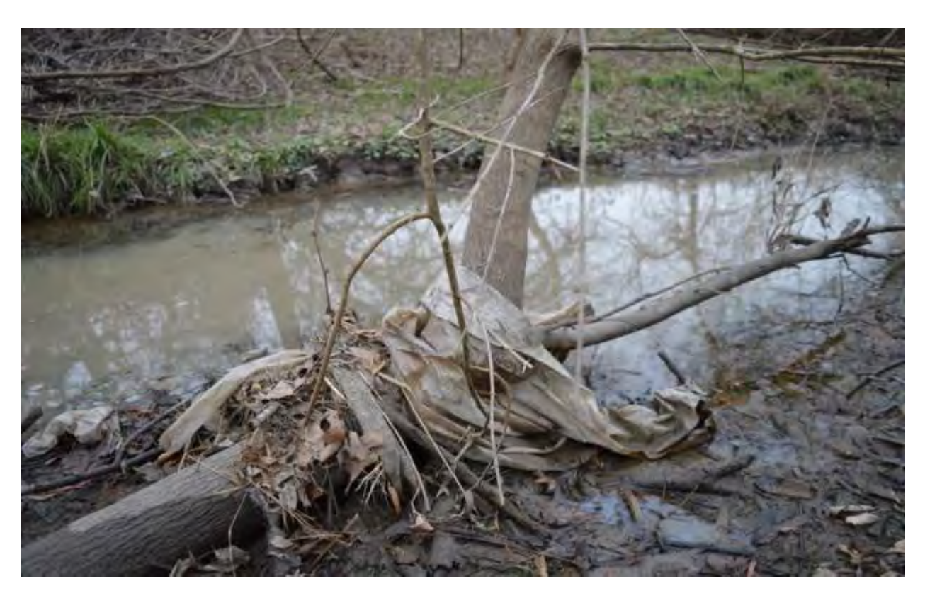
Figure 1: Creek-Waste Encounters