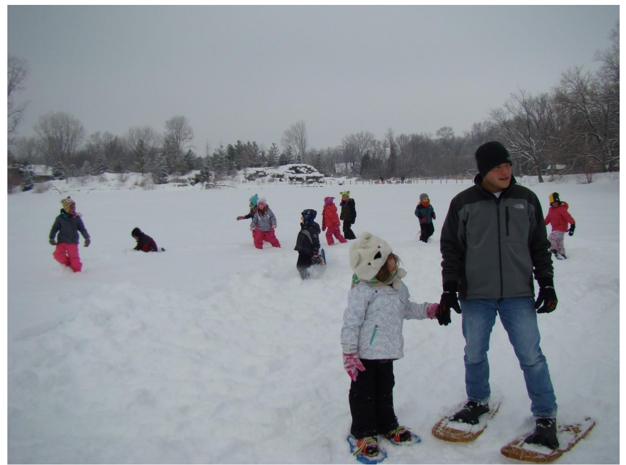
Figure 2. At the OAK Learning Center, there is no bad weather, only bad clothing.