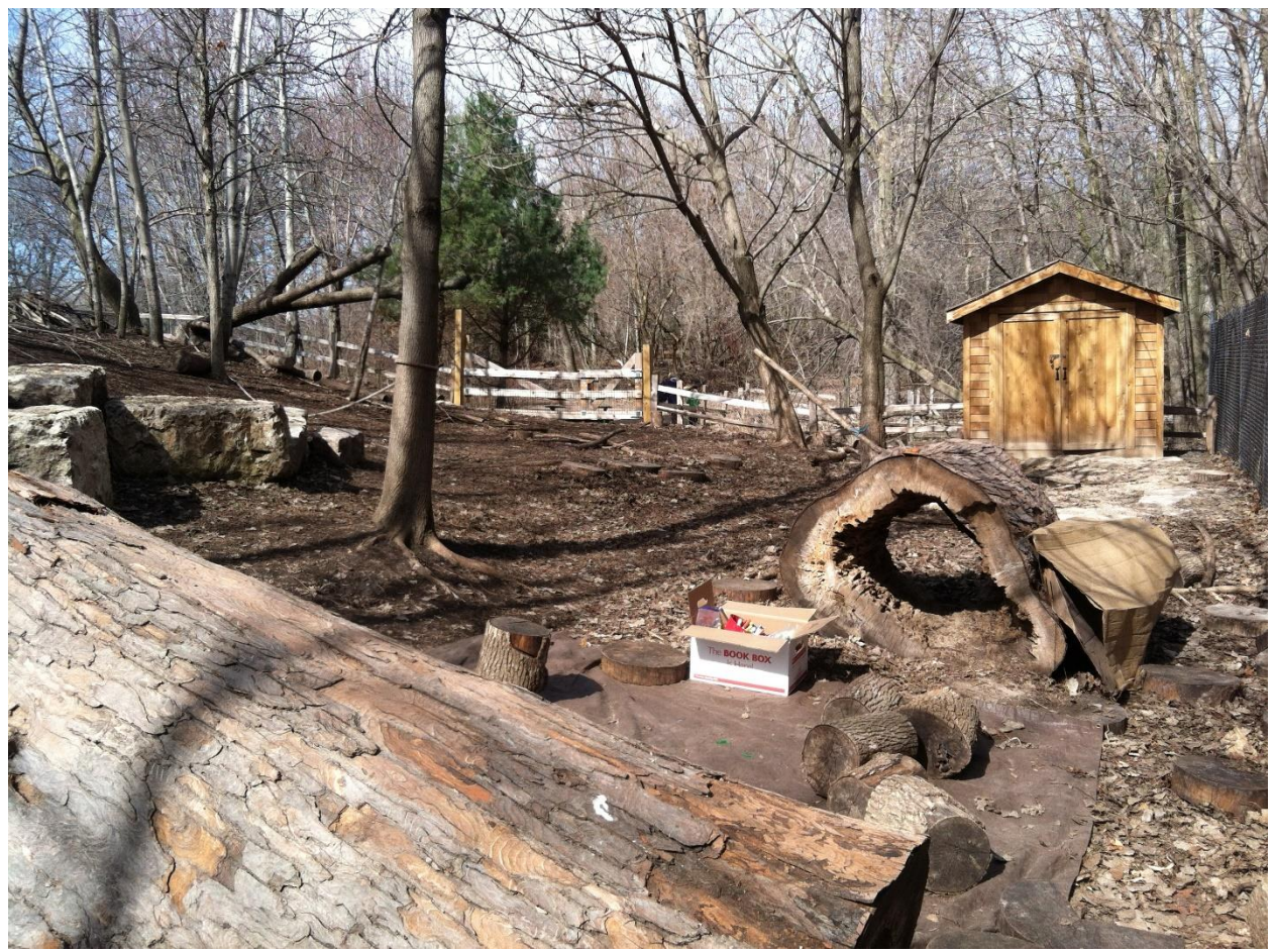
Figure 3. The outdoor exploration space includes hollow logs, rocks, and a storage shed in a fenced area.