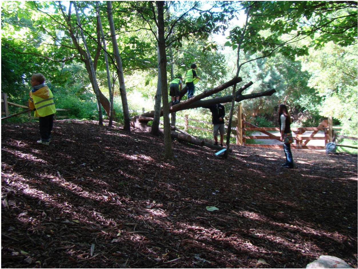
Figure 1. Students practicing their balance on a downed tree under the supervision of two adults