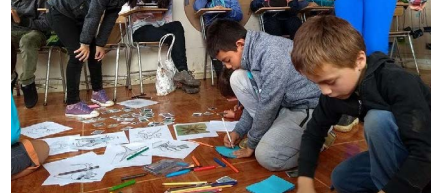
Photos: (1) Proyecto Iurukuá, Brasil; (2) Marine Education Day Poster; (3 top) Tras las huellas del venado, Uruguay; (4 bottom) Centinelas del Océano, Chile