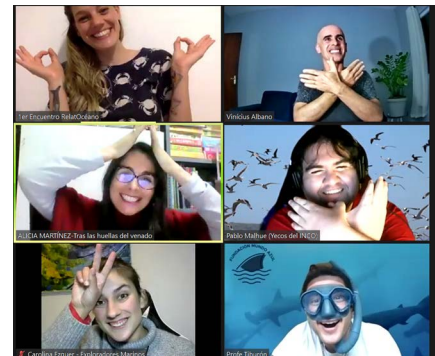
Photos: Activities on the Conference, RELATO

Additionally, we carried out post-conference consultations to solicit feedback, collecting opinions from participants to help us improve future events. A total of 107 conference attendees participated, and our most important findings included the positive impact that this type of meeting can have for the visibility and strength of marine education, and for building connections between educators from all over LAC. The full report on the establishment of RELATO can be found on the RELATO website: https://relatoceano.org