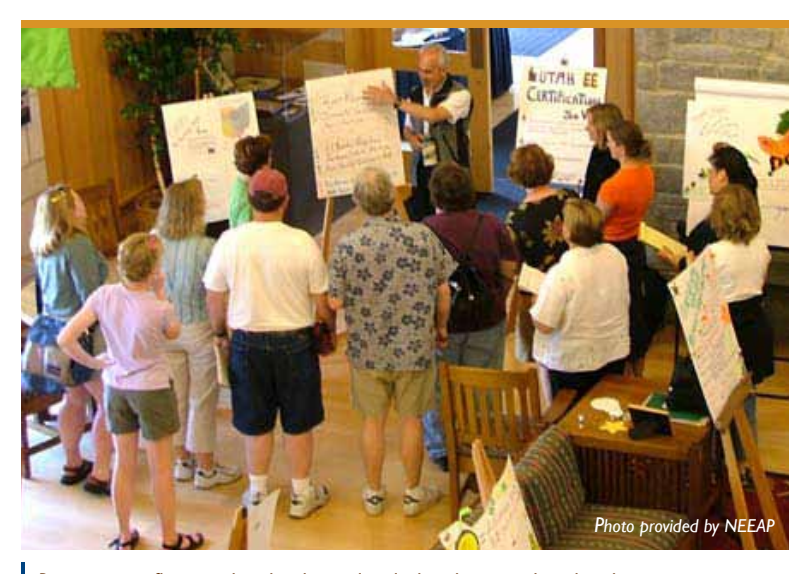
Participants reflect on what they learned and what they contributed to the 2005 National Leadership Clinic, which was sponsored by NEEAP with funding from EETAP and the U.S. Environmental Protection Agency. The Leadership Clinic model was specifically designed to further state and provincial efforts to build comprehensive EE programs.

A 2009 survey of its members by the Affiliate Network confirmed that many affiliates are financially challenged, and unable to meet increasing demands for high-quality environmental education.