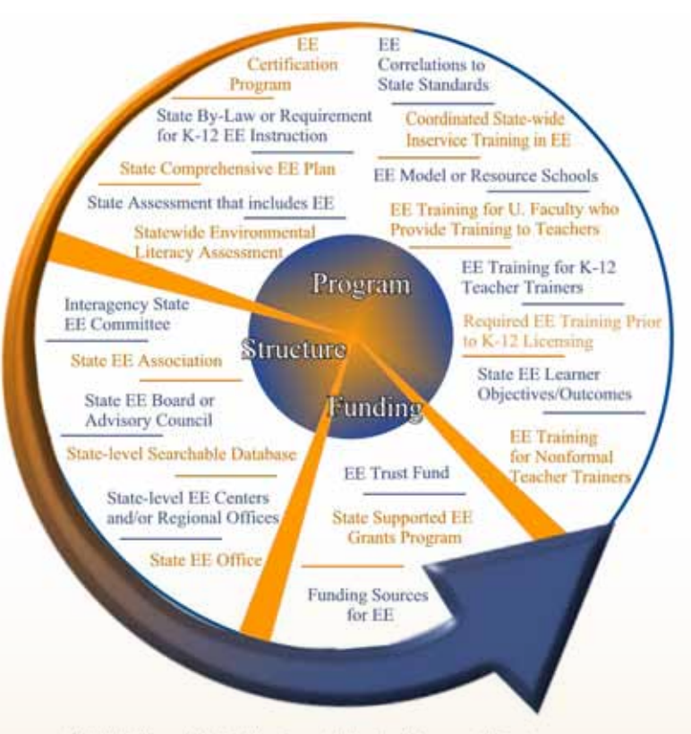
© All Rights Reserved. National Environmental Education Advancement Project

In some states, the early infrastructure revolved around state EE legislation that resulted in agency staff commitments to EE and the development of K-12 learning requirements. University programs